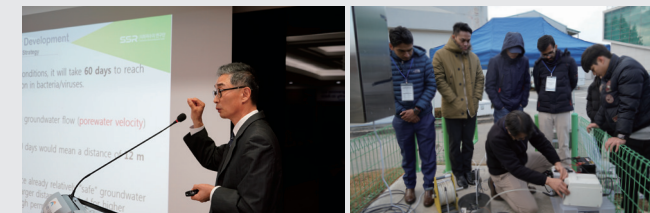
International Training & Education Sessions, i-WSSM

The project is currently underway in Kenya and Gabon. In Kenya, the project began in 2019 with consultation on ground water management and policy suggestions, as well as invitation of officials for training. In Gabon, the project has begun a 3-year process, beginning this year and set to end in 2022, to forecast climate change impacts, offer consultation on smart water management, and offer policy proposals.