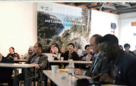
9th WNICBR Training Course(2019)