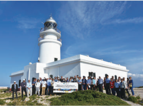
8th WNICBR Training Course(2018)

The Jeju government helps promote the World Network of Island and Coastal Biosphere Reserves (WNICBR), serving together with the Menorca local government in Spain as the network's joint secretariat. Through this project, Jeju generates added value by establishing regional strategies that contribute to enhanced management of biosphere reserves in responding to climate change and in preserving and making proper use of biodiversity.