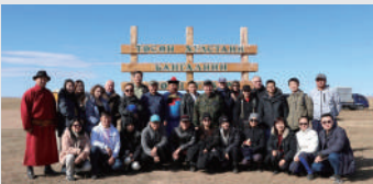
Field visit to Toson-Khulstai Biosphere Reserve, Mongolia during the 16th meeting of the EABRN(2022)

With the support of the Ministry of Environment, the KNCU has been supporting the activities of the East Asian Biosphere Reserve Network (EABRN) since 1996. The ROK was at the forefront of creating this network for regional cooperation to promote the conservation and sustainable use of biodiversity. This project encourages exchanges and capacity-building within the region by holding regular meetings and training workshops for managers of biosphere reserves.