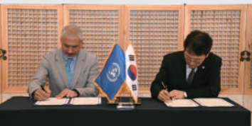
Cultural Heritage Administration-UNESCO MOU signing ceremony

This project uses local community involvement to build links between World Heritage and Intangible Cultural Heritage for sustainable development. By promoting the use of traditional technologies by local communities, this project has helped these communities revitalize and improve the preservation and management of World Heritage, while contributing to ensuring both the protection of World Heritage and sustainable development.