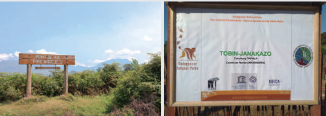
Left: Marojejy National Park, Madagascar Right: Project sign at Andohahela National Park, Madagascar

Drought and other impacts of climate change mean that some national parks in Madagascar are facing deforestation as local populations have been forced to turn to slash and burn agriculture. This project supports efforts to improve the lives of low-income local people, and promote gender equality, sustainable development and humanitarianism through biodiversity conservation and improvement of natural resource management in those national parks.