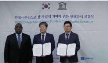
National Archives of Korea-UNESCO MOU signing ceremony

The project aims to safeguard the records of oral traditions in Africa left by Amadou Hampâté Bâ, a world-renowned ethnologist from Mali, by classifying, preserving and digitizing them for use by present and future generations.