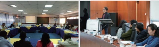
Left: Workshop held in Kenya Right: Training Session, UNESCO International Centre for Water Security and Sustainable Management (i-WSSM)

To strengthen water security in developing countries, the project supports groundwater mapping and development in Zambia, capacity-building for groundwater monitoring and management in Timor-leste, and capacity-building for integrated water resource management in Bhutan.